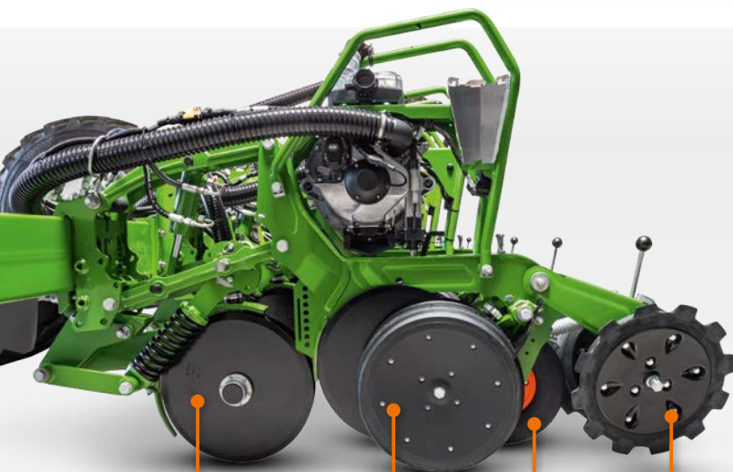
FerTeC Twin HD double disc coulters