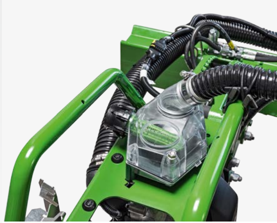
The reception unit with its small intermediate store above each sowing unit