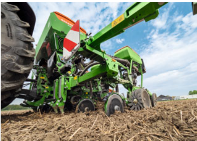
Precea in work with tractor wheel mark eradicators