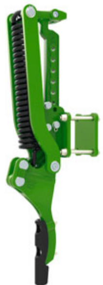
Tractor wheel track eradicators for loosening compacted wheel marks