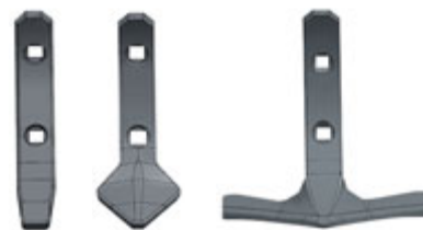
Narrow share, diamond share and wing share