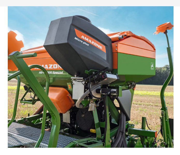
The Micro plus hopper can be easily accessed via the loading board