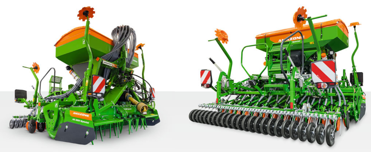
Illustrations, content and technical data are not binding and may differ depending on the level of equipment. Country-specific road traffic regulations apply and must be complied with, meaning that special approval may be required. The permissible axle loads and total weights of the tractor have to be checked. Not all the listed combination options are possible with all tractor manufacturers.