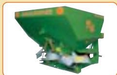
ZA-XW Perfect, 500l twin disc fertiliser spreader