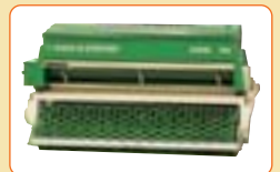
Grass re-seeding combination

AMAZONEN-WERKE H. DREYER GmbH & Co. KG · P. O. Box 51 · D-49202 Hasbergen-Gaste/Germany Tel. +49 (0)5405 501-0 · Fax +49 (0)5405 501-193