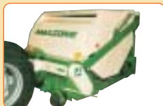
Groundkeeper with high-lift hopper discharge