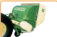
Groundkeeper with rear discharge hopper emptying