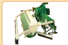
Hard court conditioner